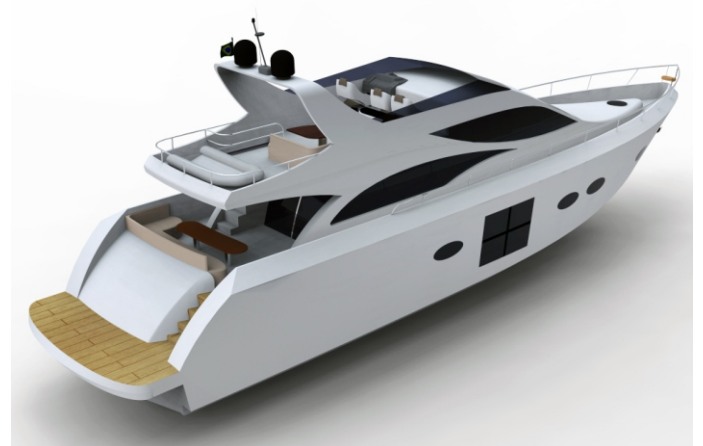
Fictio 80' - Projeto