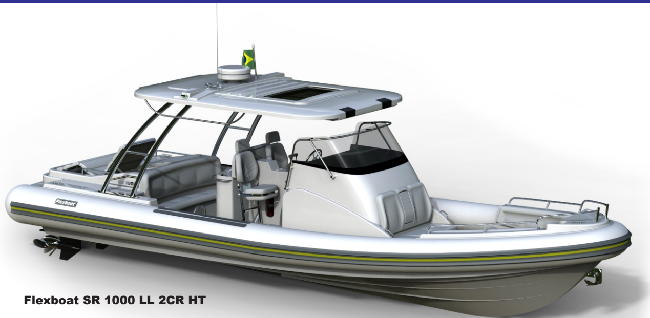
Flexboat SR 1000 LL 2CR HT