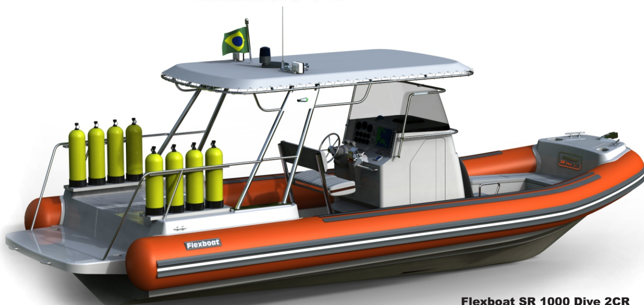
Flexboat SR 1000 Dive 2CR