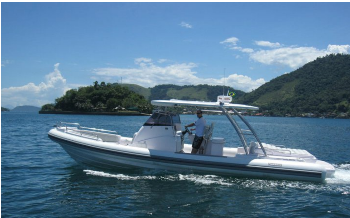
Flexboat SR 1000 LL 2CR HT