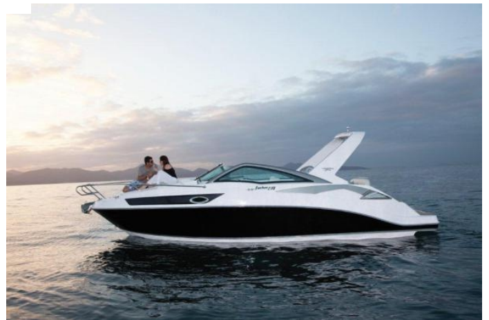
Fibrafort Focker 275