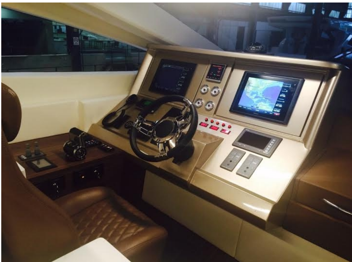
Painel de Comando - Intermarine 80