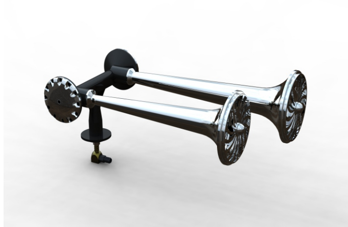
Buzina a ar