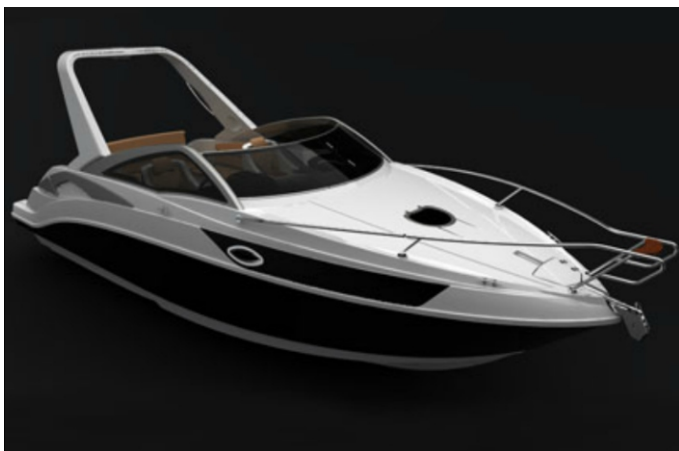
Fibrafort Focker 275