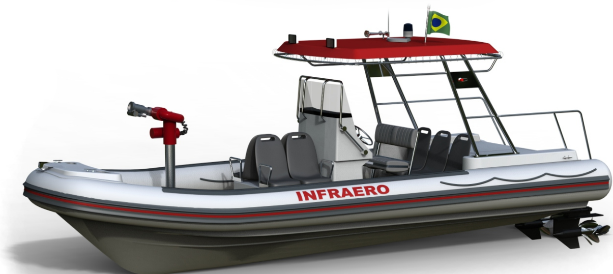
Flexboat SR 1000 2CR Infraero