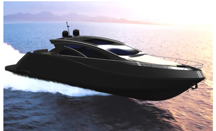
Slocum 48' - Projeto