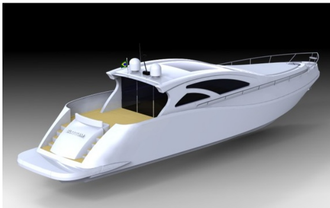
Slocum 48' - Projeto